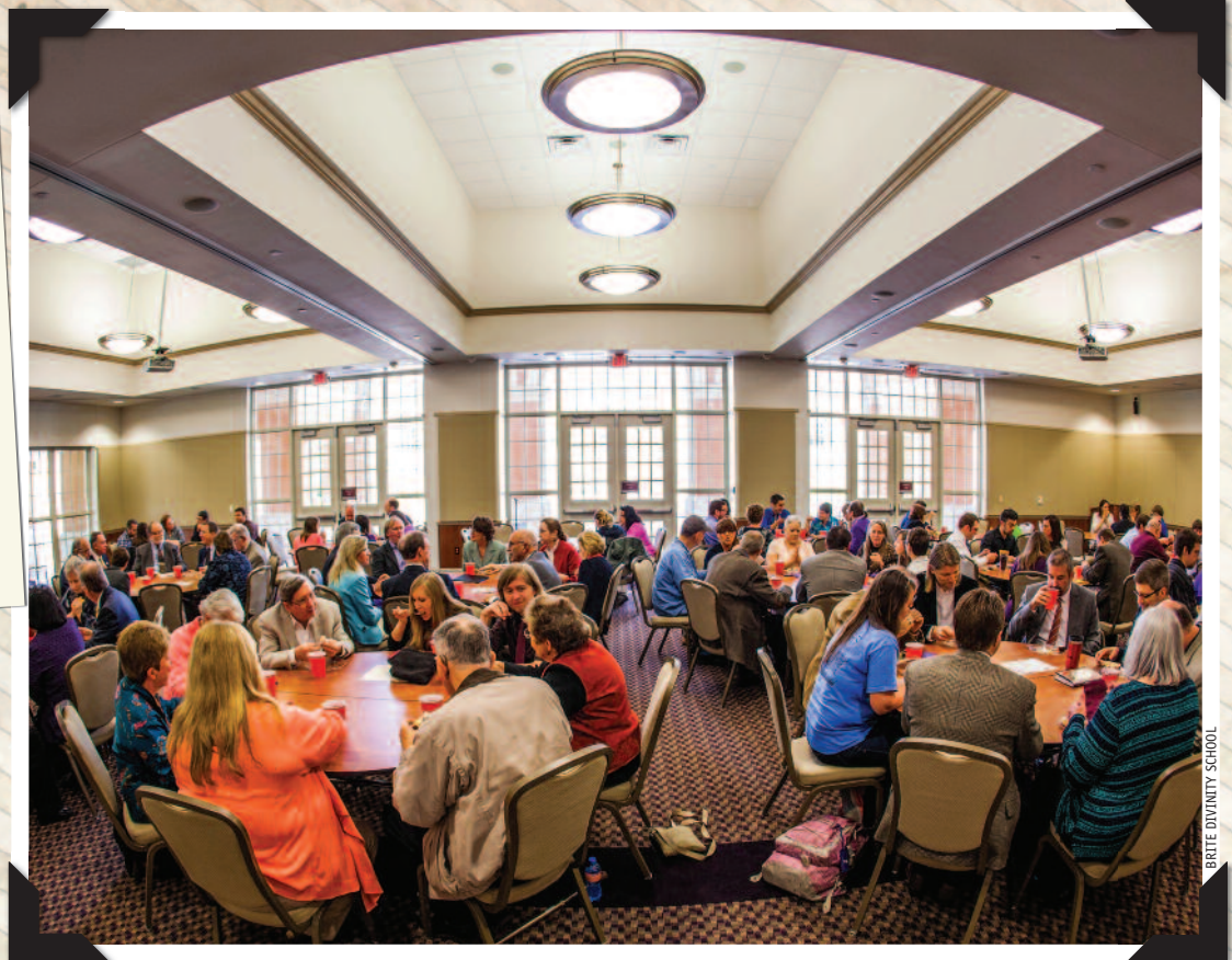
BRITE DIVINITY SCHOOL

The new Harrison building houses Brite's faculty and administrative offices and features nine classrooms, including the Walker Preaching Center, a technology-enhanced preaching laboratory. The building also includes four conference spaces, some of which are rented out for private functions.