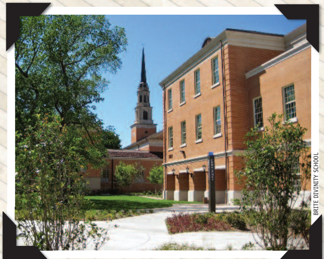
BRITE DIVINITY SCHOOL