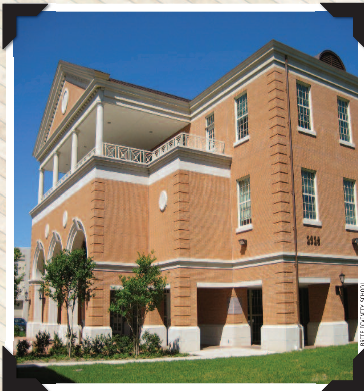
BRITE DIVINITY SCHOOL

The new Harrison building houses Brite's faculty and administrative offices and features nine classrooms, including the Walker Preaching Center, a technology-enhanced preaching laboratory. The building also includes four conference spaces, some of which are rented out for private functions.